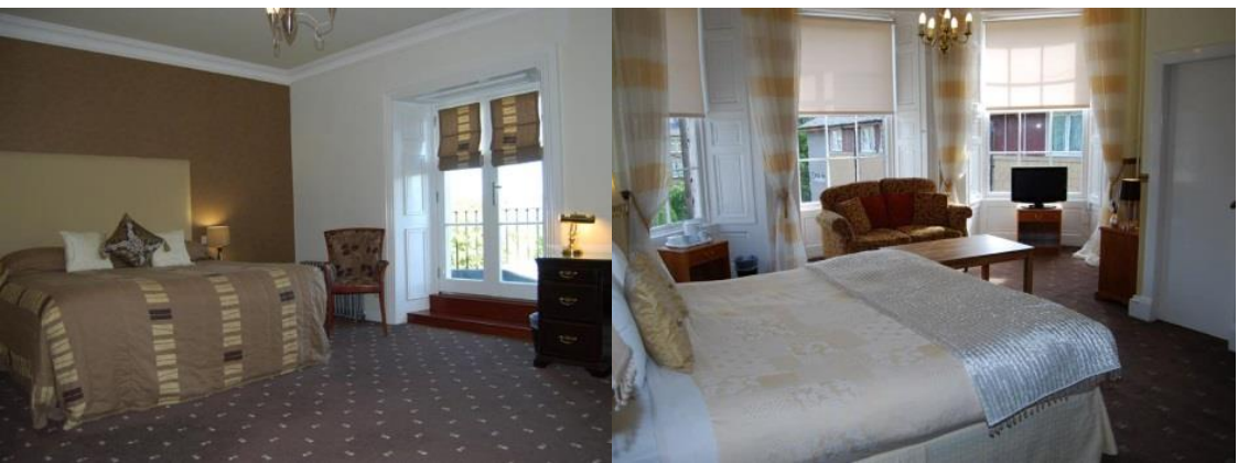
Insert: Premier Bedrooms

(Additional charge for z-bed occurs; please request in advance)