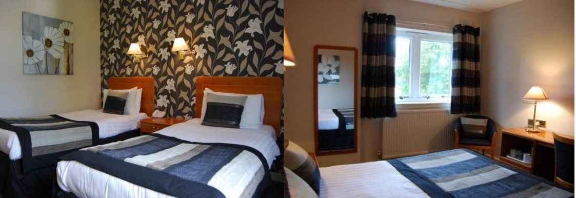
Insert: Executive Double and Twin Bedrooms

Our Double & Twin Rooms are located in our new wing, modernised and perfect for short stays.